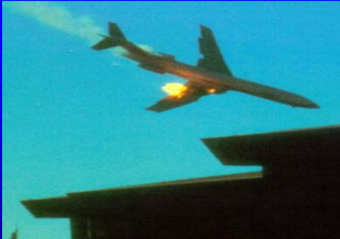
Boeing 727/Cessna 172 San Diego September 1978