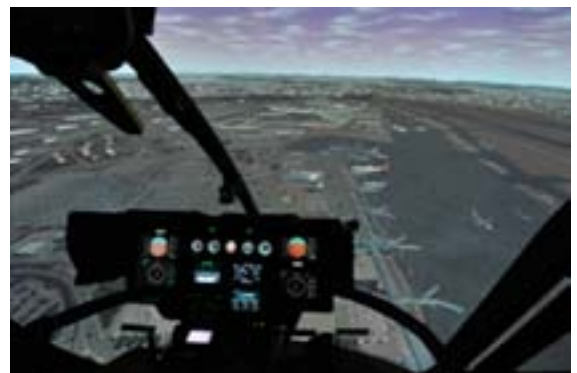
Figure 1 : FNPT Main Features