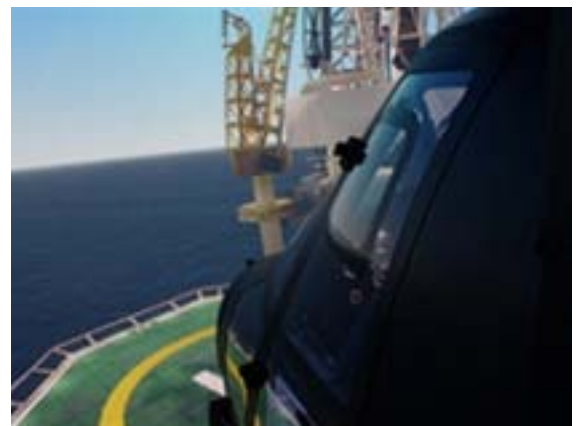
Figure 3 : FFS Main Features