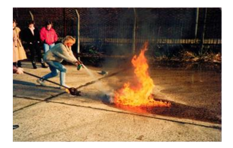
Practical fire training in the 1980's

During training in the 1980's, aircraft crew usually fought fairly large fires in the open air. At that time oil tray fires were favoured and Halon could be used. These fires were usually quite large and challenging. They could be difficult to extinguish unless the correct procedure was used, such as aiming the extinguisher at the base of the flames. Re-ignition was often a major factor. Whilst a fire of such size would be most unlikely to occur on a commercial aircraft, it did provide an awareness of the problem and also the effectiveness of Halon.