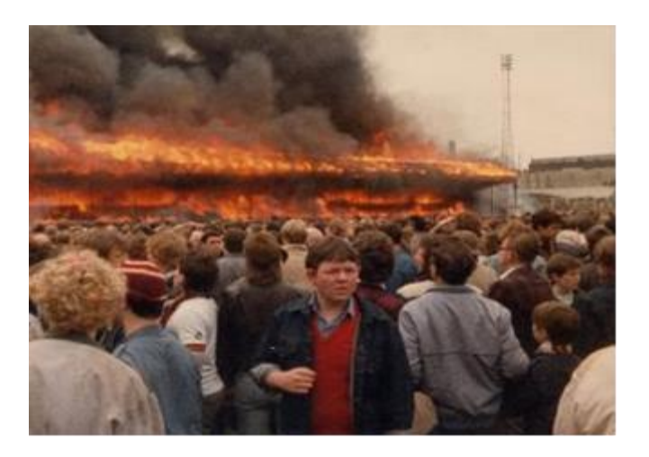
Bradford City Football Stadium fire – May 1985

There were 56 fatalities. The cause of the fire was probably a match or cigarette being dropped on debris which then ignited (HMSO, 1986).